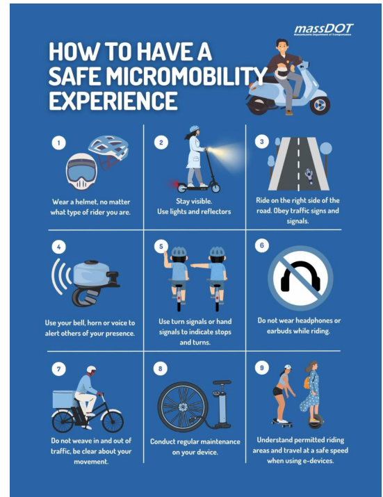
MassDOT flyer on how to have a safe micromobility experience