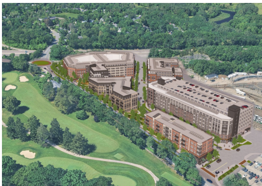
Aerial rendering of potential Riverside project

Address: 335 Grove St and 399 Grove St, Auburndale (MBTA Riverside T Station)