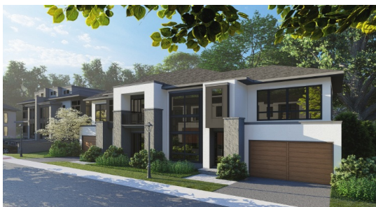
Street view rendering of potential Dudley Rd project