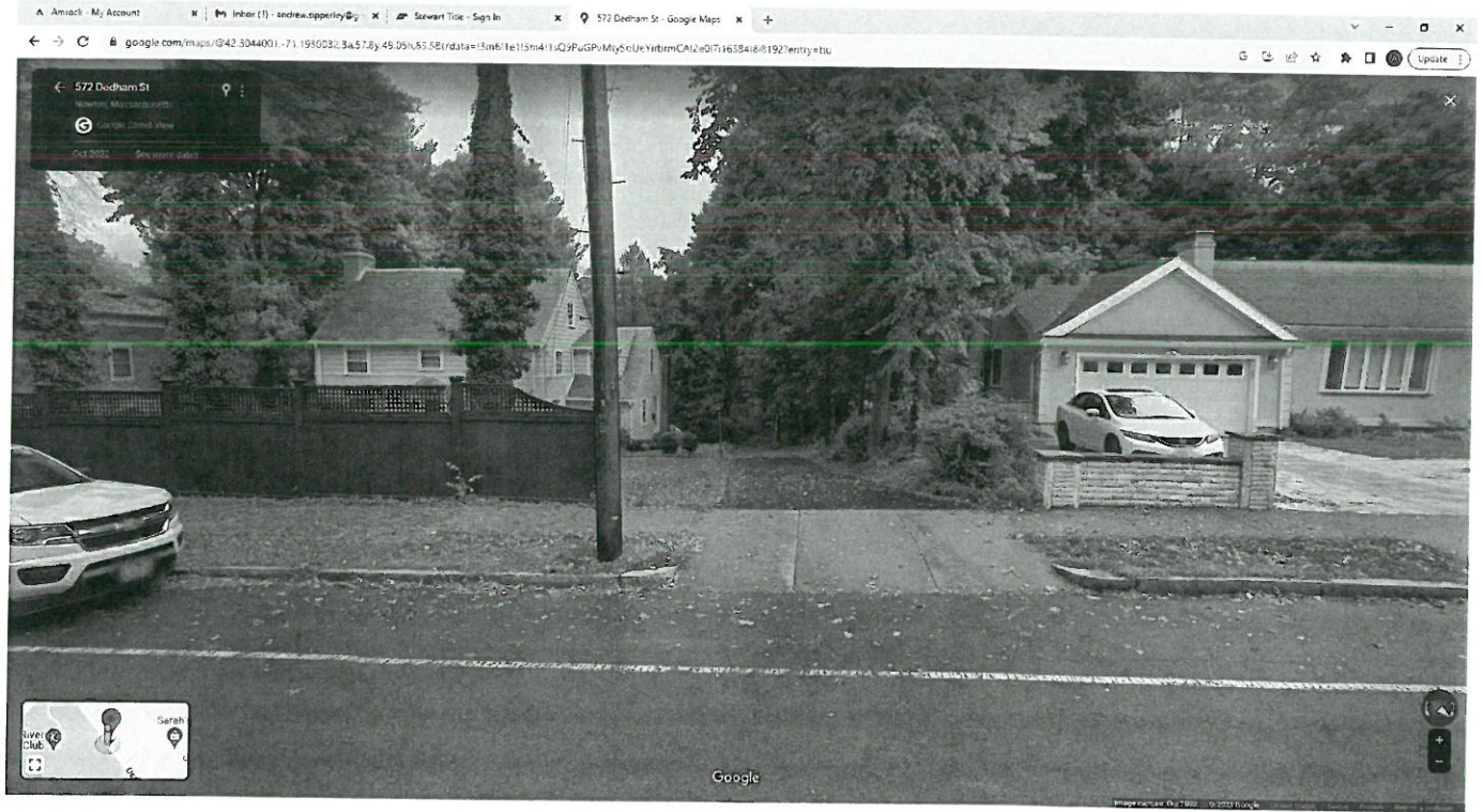
572 Dedham Street paving project